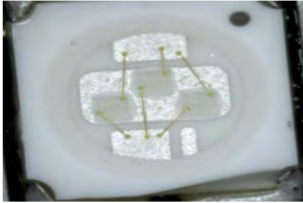
LS2-6140 used in a 1.2 W package

These versatile silicones provide durable support and protection in electronic and photonic applications.